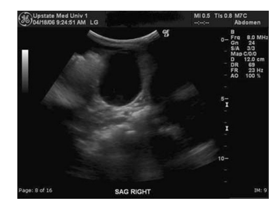
Fig. 3 Abdominal US image

torsion is a rare, but important cause of abdominal pain in younger children that requires a high index of suspicion (Figs. 1, 2 and 3).