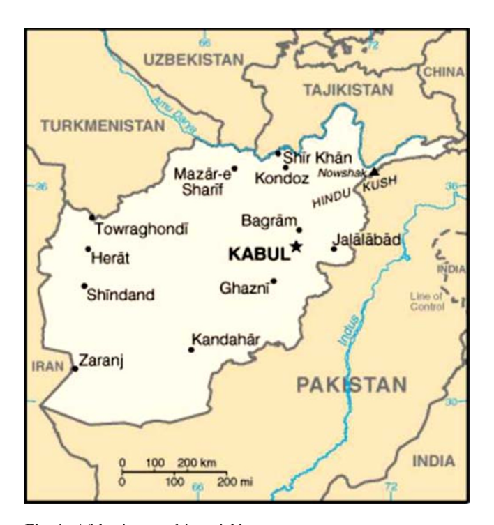
Fig. 1 Afghanistan and its neighbors

Since 2001, Afghanistan's health status has improved slowly, but much still needs to be done [6]. Emergency medicine in Afghanistan has not been developed or