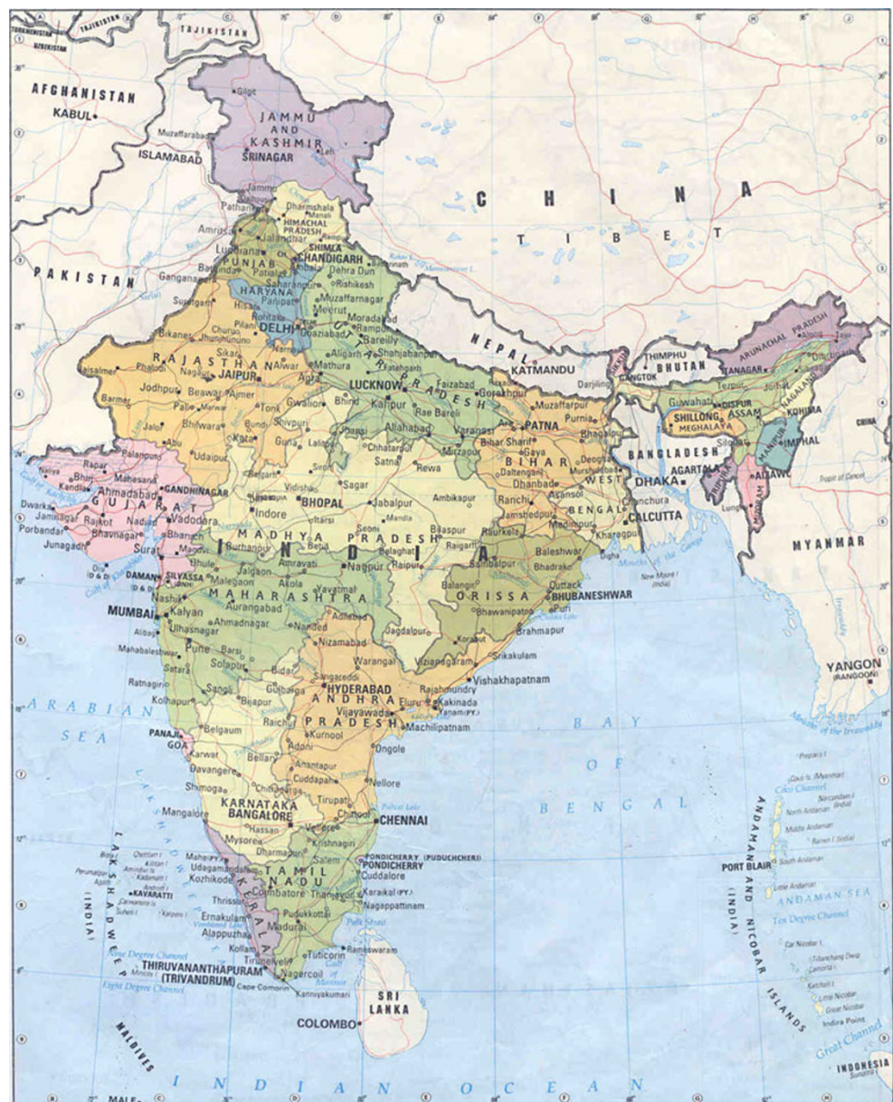
Fig. 1 Political map of India

far below the required number. The lack of organized pre-hospital care coupled with the lack of resources and the high volume of patients that through the government-run tertiary care hospitals further compound problems [7].