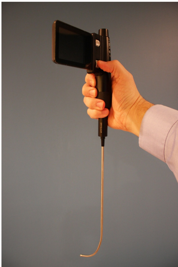
Figure 1 The Clarus Video System (Clarus Medical, Minneapolis, MN).

emergency physicians with the CVS in an unexpected difficult airway situation with little to no experience with the device.