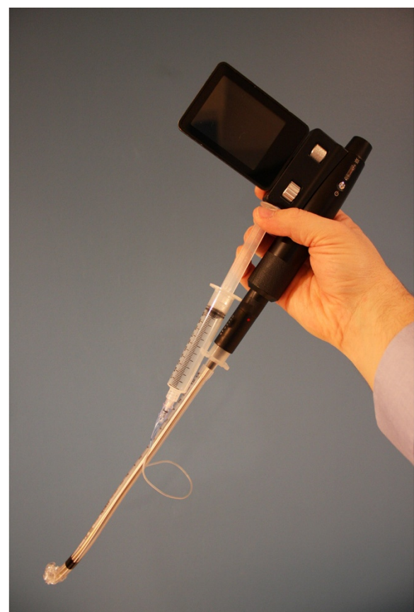
Figure 2 Endotracheal tube in position over the CVS.

utilizing the CVS alone (without the use of a laryngoscope) was given describing a midline approach with the device. Alternative approaches to the use of the CVS were not discussed. During the practice period the mannequin was set to simulate an apneic patient with normal airway, and no restrictions were imposed upon technique or positioning of the head or neck. For the data collection phase of the study, the mannequin was then placed in a c-collar and set to simulate an apneic patient with an edematous tongue, posterior pharyngeal swelling, and trismus. Random selection was used to determine which technique would be used first by each participant. Each EP was given up to three attempts to intubate with each technique. The attempts were timed from picking up the device until the stylet (either the CVS or a standard malleable stylet) was removed from the endotracheal tube (ETT) in the mannequin. Location of the ETT after each attempt was confirmed utilizing the CVS to visualize the larynx after both techniques (Figure 3). When the EP was successful with either technique, they then utilized the other technique. If unsuccessful after three attempts with either device, the EP was instructed to move to the other technique. After completion of the intubation attempts, EPs were asked to complete a demographic and survey form. They rated