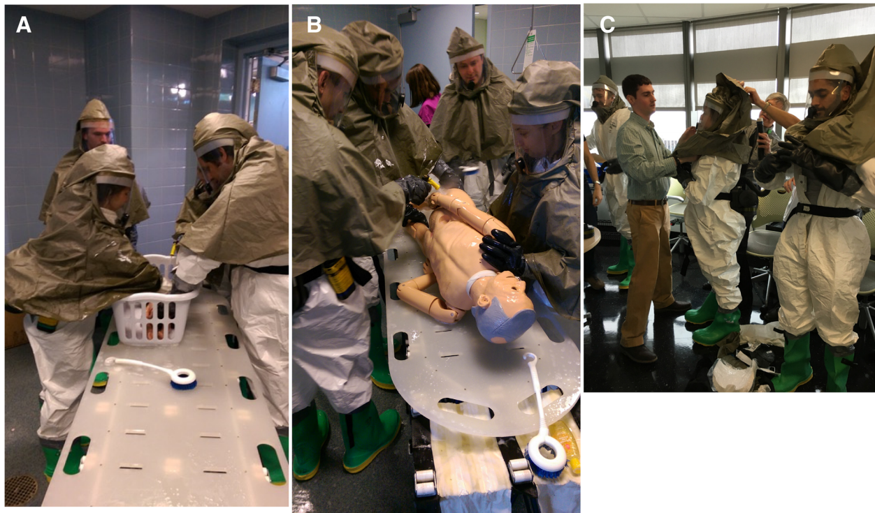
Fig. 2 a Decontamination of an infant mannequin. Medical students are shown here to be decontaminating infant patients with smaller hoses and soft scrub brushes. The infant is placed in a basket and carefully cleaned. The decontamination occurs on a conveyor belt where medical students down the line have varying responsibilities. b Decontamination of an adult mannequin. Medical students are shown here to be decontaminating an adult mannequin with high-pressure hoses while practicing proper turning of a patient on a backboard. c Donning personal protective equipment. Medical students are shown here assisting each other in the donning and doffing of HazMat gear. They are working in pairs to assure that all of the equipment is secure and functioning properly

signs of the team members before donning and after doffing the suits. It is also continuously emphasized during training and simulations that team members should immediately remove themselves from a decontamination situation, whether real or simulated, if they do not feel well and are at risk of compromising the safety of themselves, their teammates, or the patients. It is also important for team members to monitor each other to monitor for any signs of fatigue.