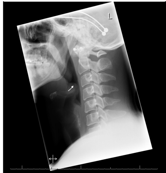
Fig. 1 Lateral neck soft tissue radiograph: poorly defined and thickened epiglottis. The arrow points to the thumb sign which is commonly associated with acute epiglottitis

The patient received intravenous Dexamethasone in the emergency department, which immediately improved his shortness of breath. A throat culture was negative for group A, B, and C Streptococcus. COVID-19 was ruled out with a PCR nasal swab. The total peripheral white blood cell count was mildly elevated, but the rest of the renal and metabolic panels were normal. A lateral soft tissue radiograph of the neck showed a poorly defined and thickened epiglottis with a classic thumb sign, indicating acute epiglottitis (Fig. 1).